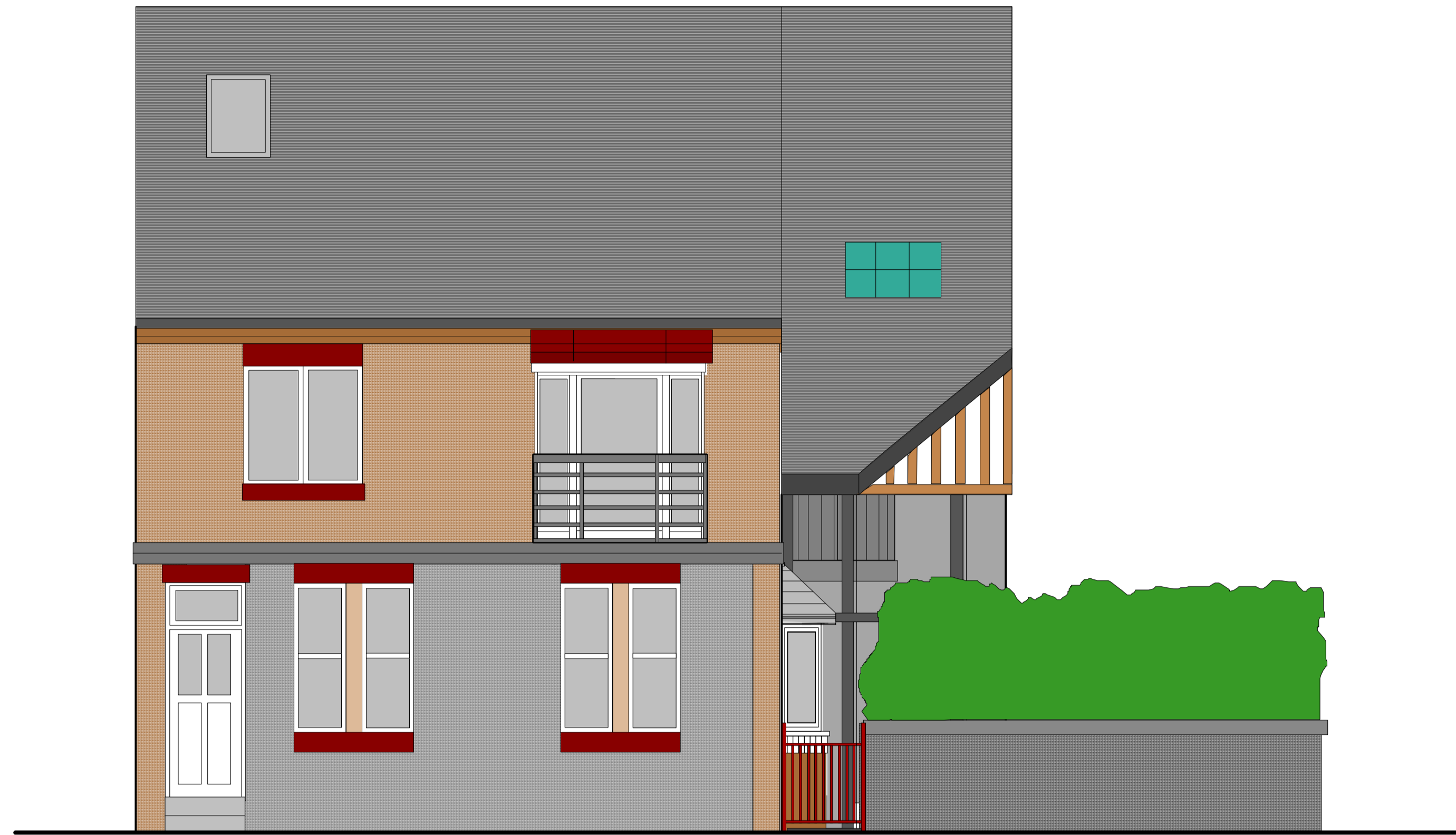
Front Elevations 107 & 109