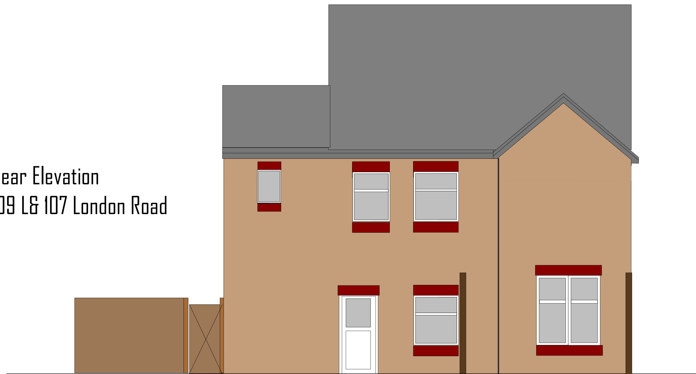
Rear Elevation 109 L& 107 London Road